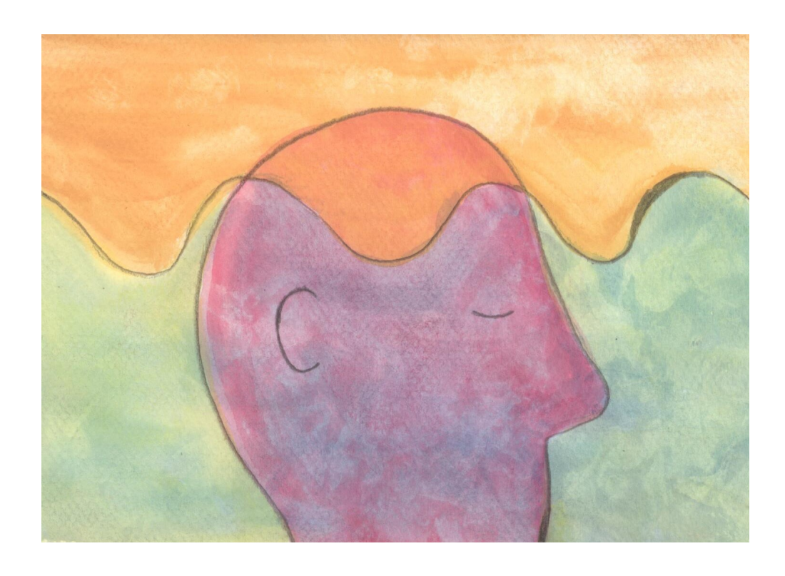
the inner me finds synchrony