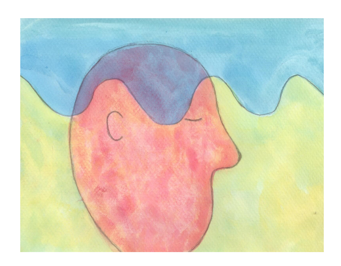
inner sky inner hills